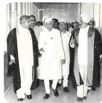
Pt Jawahar Lal Nehru walking down the corridors of Nehru Hospital.