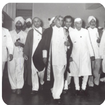
Pt. Jawahar Lal Nehru Inaugrating the Nehru Hospital on 7th July 1963.

The PGIMER owes its inception to the vision of late Sardar Partap Singh Kairon, the then Chief Minister of Punjab and the distinguished medical educationists of the then combined state of Punjab, supported by the first Prime Minister of India Pt. Jawahar Lal Nehru who considered the institutions of scientific knowledge as temples of learning and the places of pilgrimage. The institute started in 1962 and Pt Jawahar Lal Nehru inaugurated the hospital now named "Nehru Hospital" on 7th July 1963. The Institute was originally under the Government of undivided Punjab. After the reorganization of the state, the administrative control of the institute passed on to the Union Territory of Chandigarh in November 1966. The Institute became an autonomous body under the Act of Parliament in 1967 functioning under the Ministry of Health and Family Welfare, Government of India, with the following mandate.