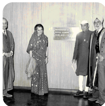
Prime Minister Smt. Indira Gandhi inaugurating the Research Block in November 1968