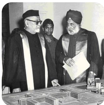
President Dr. Zakir Hussain inaugurating the Zakir Hall in December 1967.